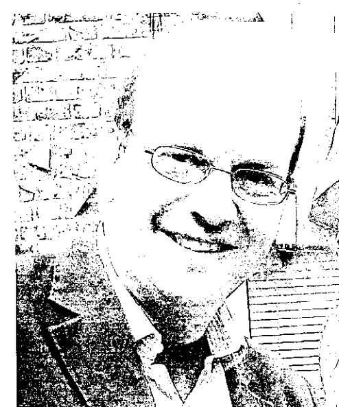
POLICE AUTHORITY: Tory MP Mark Reckless

The Tory MP said: "We had been planning for a £53m reduction in government grants, but it's actually more like £43m, so I have to question whether it's absolutely necessary to lose as many